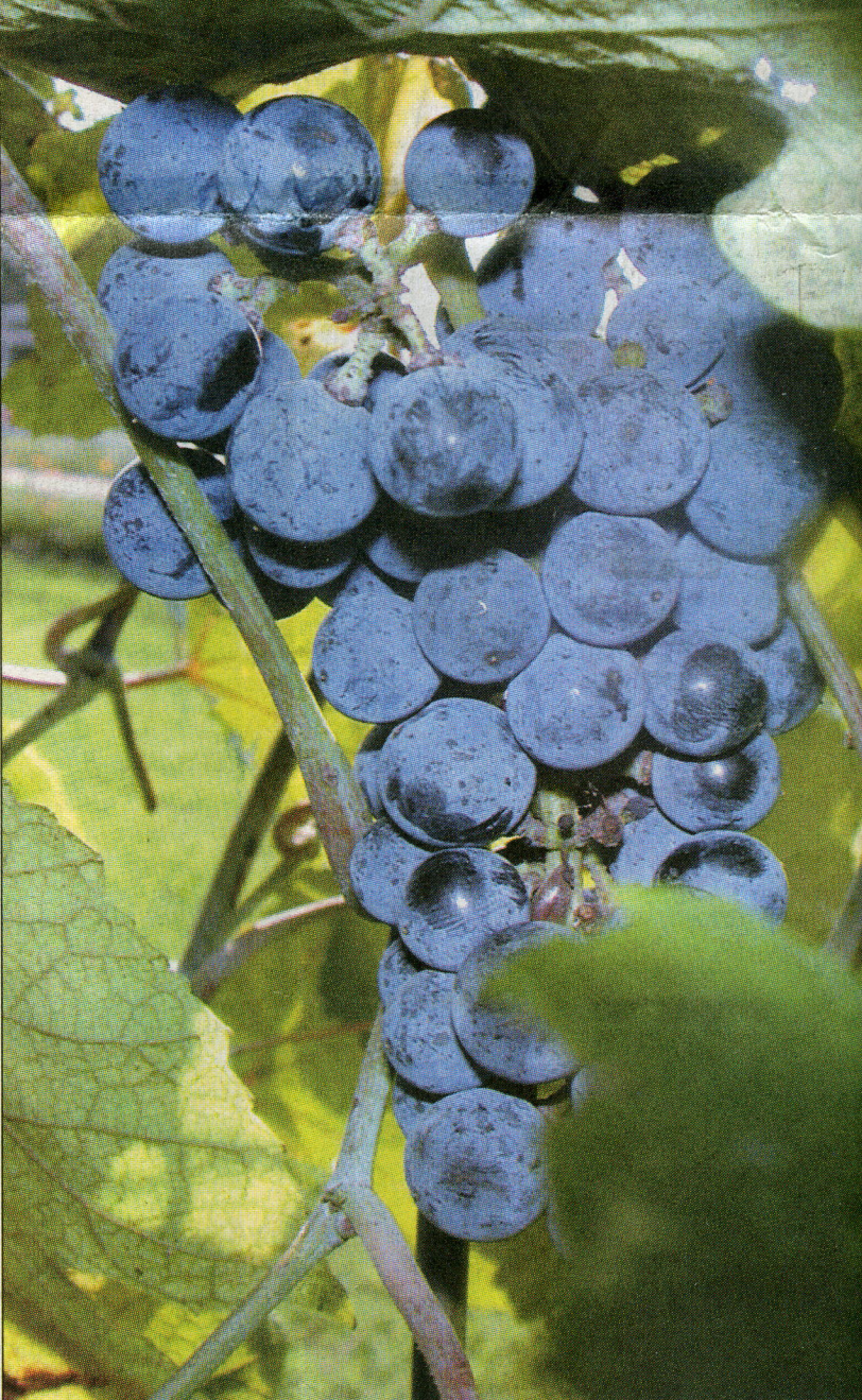
Cynthiana grapes are grown in the vineyard at Stone Bluff Cellars. The grape is native to North America and is used to make Cynthiana dry red, Maria sweet red and Royale dessert wines at the Stone Bluff winery.